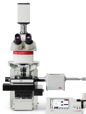
THUNDER Imaging System

Widely recognized for optical precision and innovative technology, Leica Microsystems is one of the market leaders in microscopy: anywhere from stereo to digital microscopy and all the way up to super-resolution, as well as sample preparation solutions for electron microscopy. Users of Leica instruments can be found in many fields: life science research, throughout the manufacturing industry, surgical specializations, and in classrooms around the world.