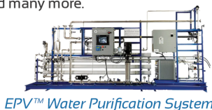
EPV™ Water Purification System

Evoqua provides solutions for customers with critical water needs for energy generation, food & beverage safety and production, healthcare, manufacturing and many more.