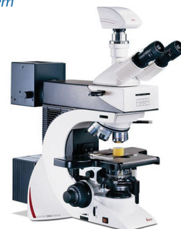
Leica DM2500 optical microscope